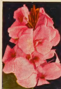
CITY OF PORTLAND